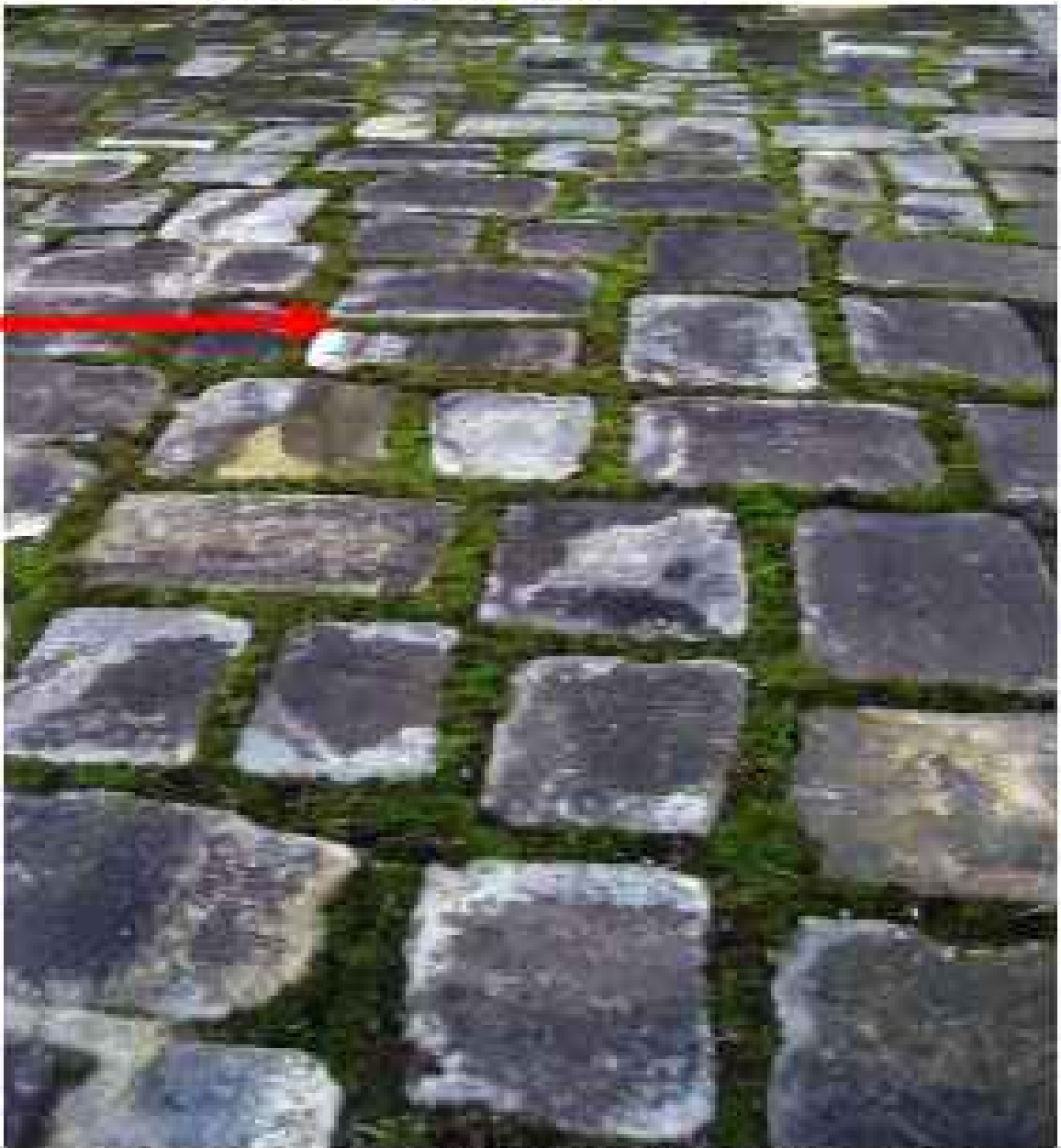
FLOORING FOR RESTAURANT