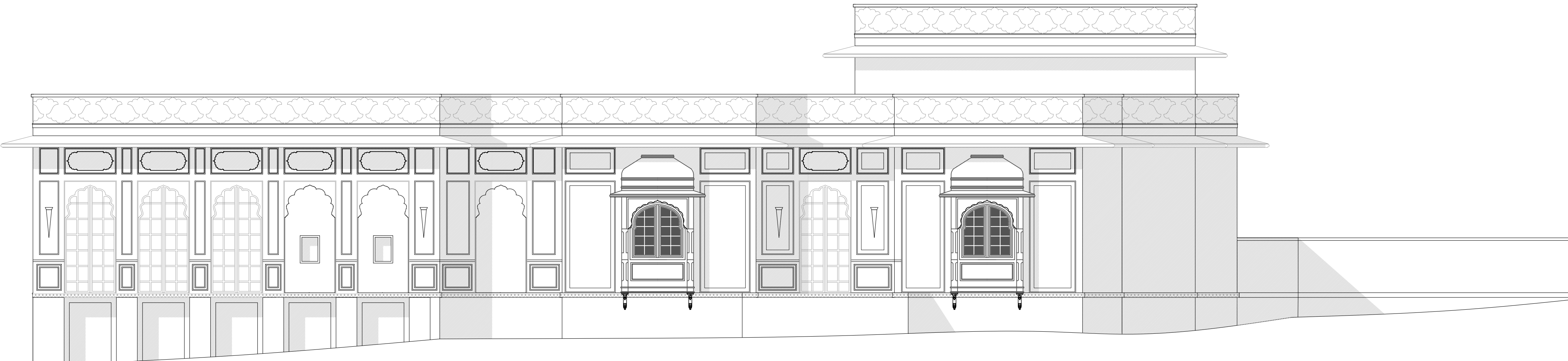
SIDE ELEVATION (E3)