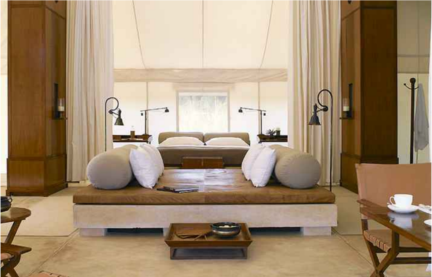
CENTRAL SEATING (REF IMAGE)