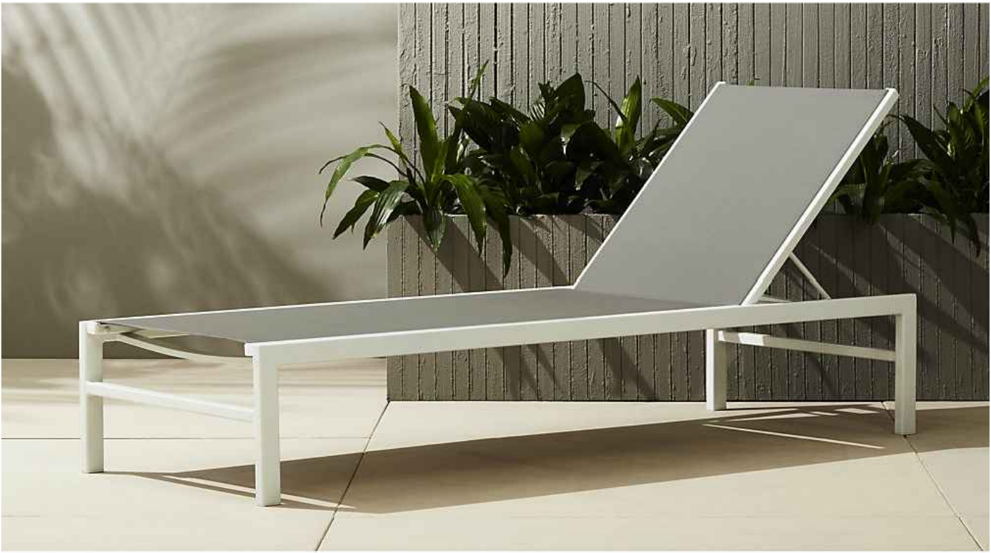
OUTDOOR LOUNGE CHAIR